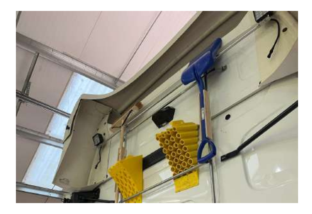
Shovel with Brackets CODE: REN-SWB