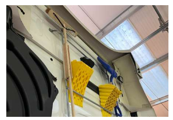
Broom with Brackets CODE: REN-BWB