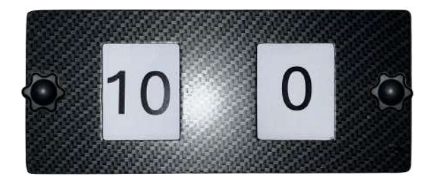
Height Indicator CODE: REN-HI