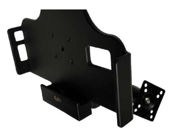
Tablets Holder CODE: REN-TH