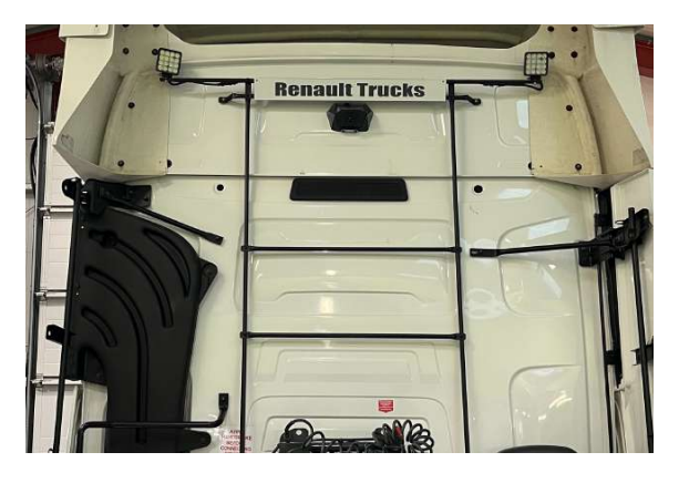
Frame Work CODE: REN-FW