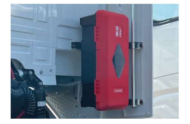
Fire Box Bracket CODE: REN-FBB