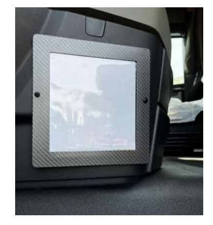
Ministry Plate Holder CODE: REN-MPH