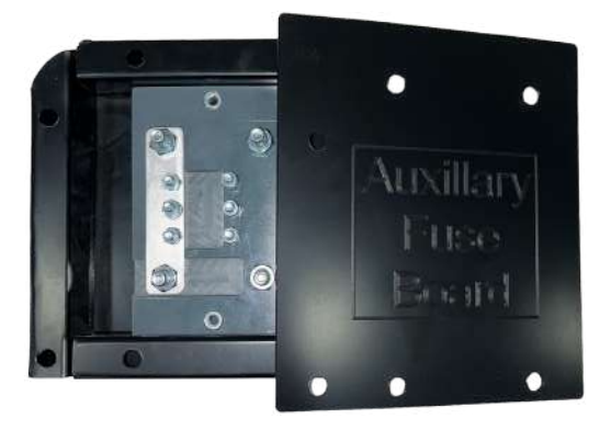
Distribution Board CODE: REN-DB