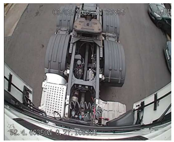
5th Wheel Camera View to assist with height of kingpin